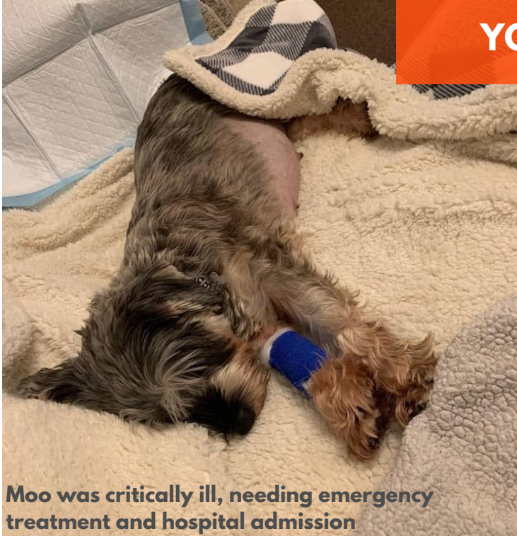
Moo was critically ill, needing emergency treatment and hospital admission

January was incredibly busy for the charity, everything seemed to happen at once. In one week we had a number of large bills for rescue dogs come in, accompanied by significant worries over their health. Thanks to the brilliant support you give the charity, we can plan for a lot, but, the nature of what we do means the unexpected is never far away.